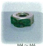
M4 ~ M6

Nut Welding : Free joint shank and special parts are applicable for nut welding. Flange type nut has more strength and less damage of screw by distributing current from flange part.