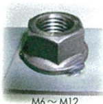
M6 ~ M12

Flat copper working table prevents protrusions on the products surface.